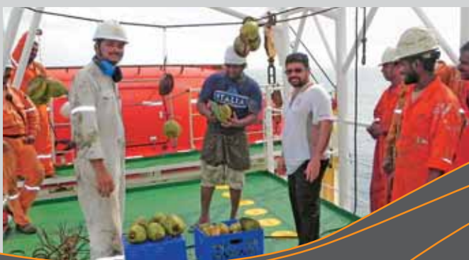
◀ Fresh provisions