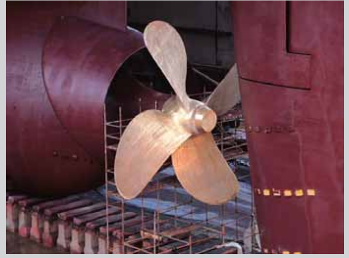
▲ Four bladed propeller after polishing