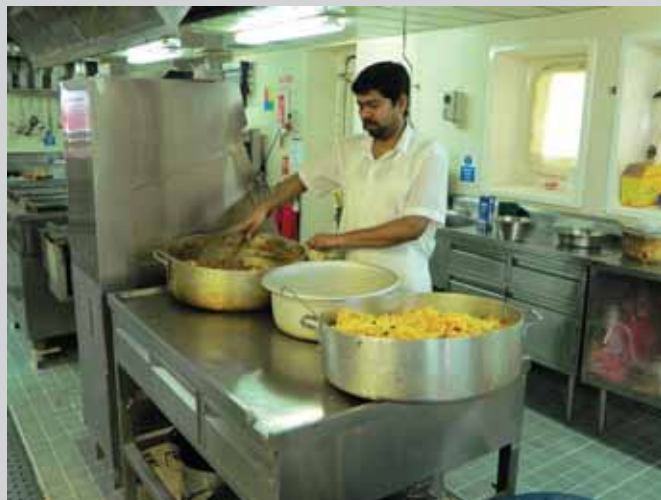
▲ Galley staff preparing another nice meal

each other's company during the non-working hours and our teamwork never suffered. Another journey lies ahead, but the Pioneer team stands ready to meet each new challenge and more.