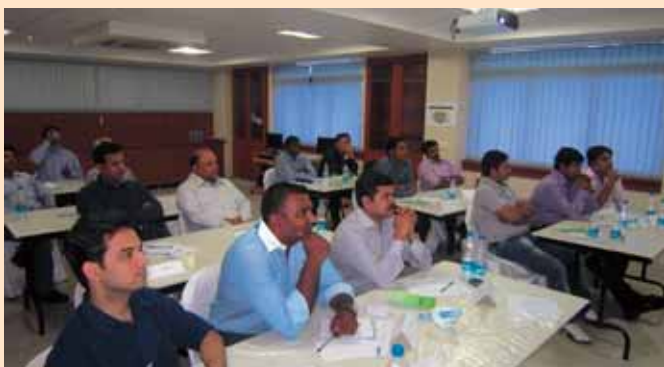
▲ Attentive officers reflect concern

Chief Engineers, two Second Engineers, a Second Officer, and a Third Engineer. Feedback from the participants indicated most found the course to be good and the content extremely useful. It is intended that the course will be conducted in both Manila and Chennai Training Centers at least three times a year so that all officers can be slated for attendance during vacation periods.