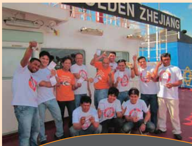
▼ Team Zhejiang winners

I am very grateful to all the personnel and staff of this company who organize/implement this safety incentive scratch card program.