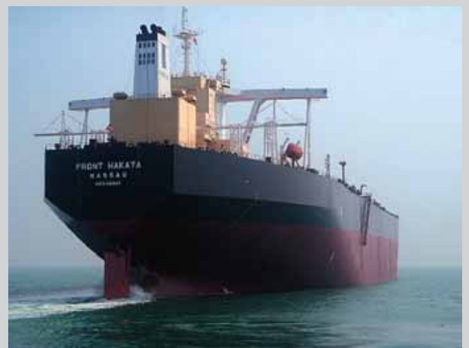
▲ Front Hakata sailing after completion