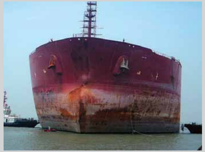
▲ Front Hakata entering the dock

After all repairs were finished, the vessel set sail for Singapore upon completion of sea trials on the 29 th Sept 2012.