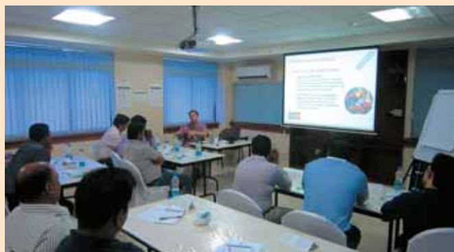
▲ Behaviour Based Safety presentation