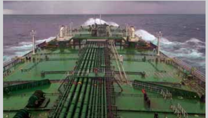
▲ Moving forward on all horizons

A day or two at the anchorage was very much needed for reviewing and preparing the vessel for discharge. But the list of jobs pending never ends, as jobs are ticked off, new ones are added: