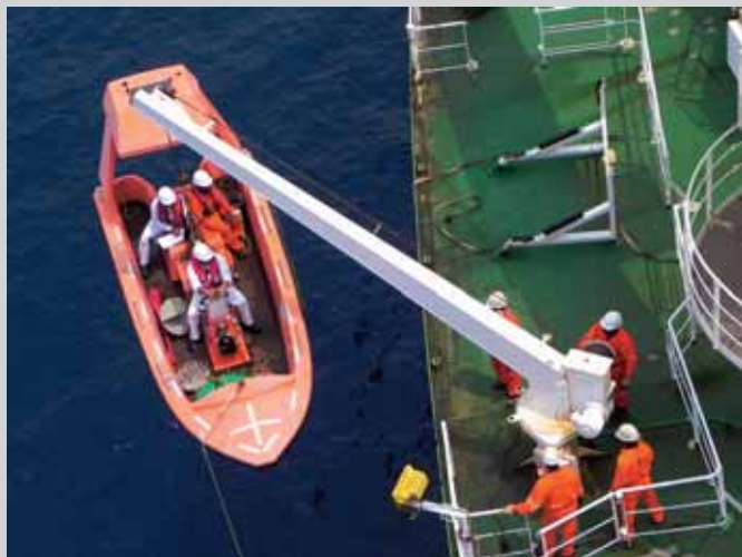
▲ Team lowering the Rescue Boat

During this hectic period, the galley staff was really appreciated for the wonderful cuisine they prepared to keep our seafarers happy. Even with heavy load of work, and during these periods of stress, the spirits of the Pioneer crew were not deterred. We all appreciated