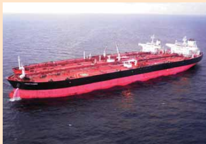
▲ M/T Front Njord engaged in Ship to Ship Transfer at the Southwest Pass STS Area Off New Orleans, Louisiana USA

It was also quite an experience to see things, which were till now on a page, in a book, one could fit in a bag, to stand out in front of you. Big enough for me to have reality checks on a regular basis to fathom the size and scale of the enormity of everything onboard, right from the engine to the generators, the boilers or the sea water pumps.