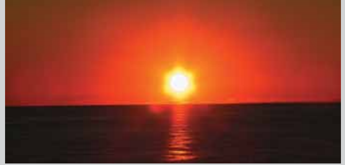
▲ Red sky at night, sailors delight

in the survey list. The survey and inspection lasted for three full days.