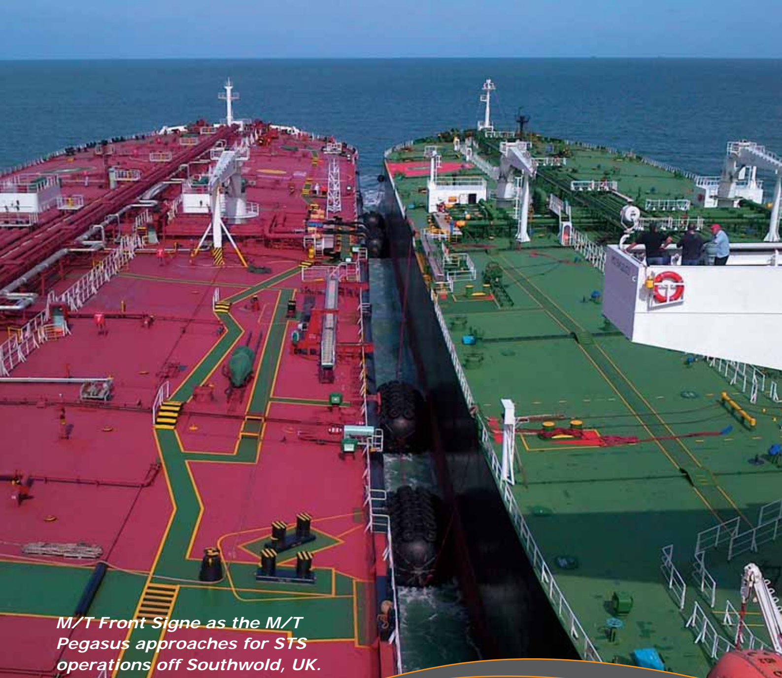
M/T Front Signe as the M/T Pegasus approaches for STS operations off Southwold, UK.